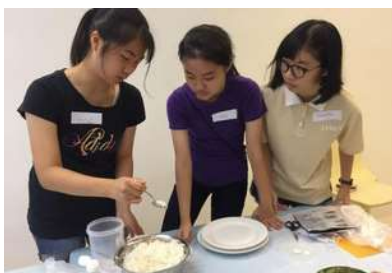
學妹認真地準備食材。

如果你也有興趣參加校友會的服務·次數不限·歡迎電郵你的聯絡資料給我們·我們希望在不久的將來·也能與你一起帶領學妹服務社群。